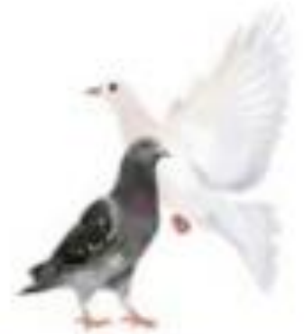
dove or pigeon