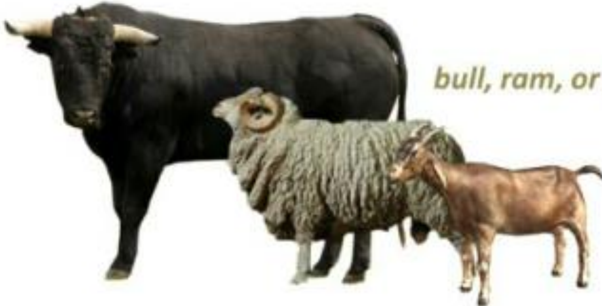
bull, ram, or goat