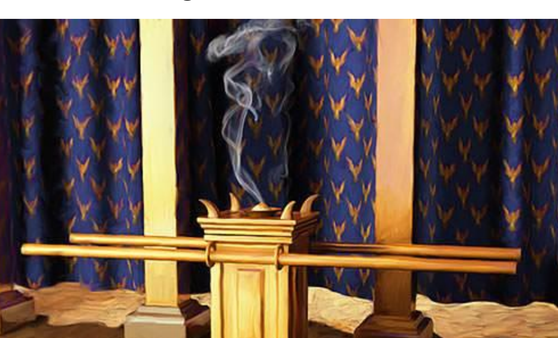
Ps 141:2 Let my prayer be before You as incense; lifting of hands as eve sacrifice